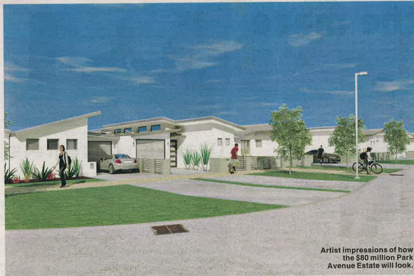
Artist impressions of how the $80 million Park Avenue Estate will look.